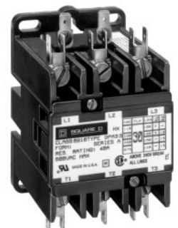
Type DPA33V02 3-Pole